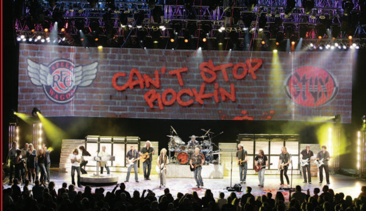
Both bands get together for a rock-out finale.

Originally, 130 PAR 64s were specified; the number was trimmed down to 104, which Dexter, who is traveling with the tour, focuses every day. “I focus them on the ground,” he says. “It only takes about ten minutes a day for a person to climb on the truss to make a few adjustments.”